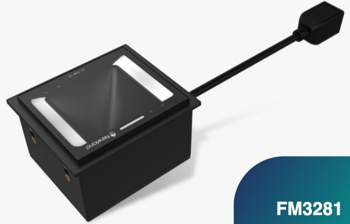
FM3281 Grouper Stationary Scanners